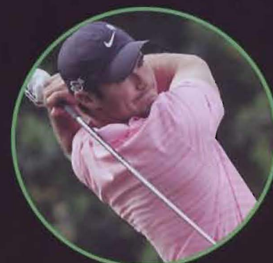
Trevor Immelman (1998) Cape Town, South Africa Current Earnings: $13,585,384 ** Won 2008 Masters

Notable Past U.S. Amateur Public Links Championship Winners