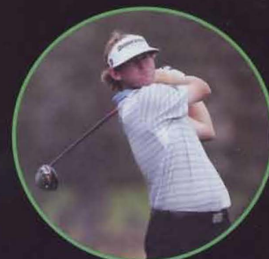
Brandt Snedeker (2003) Nashville, Tennessee Vanderbilt University Current Earnings: $4,984,594 ** Tied for 3rd in 2008 Masters